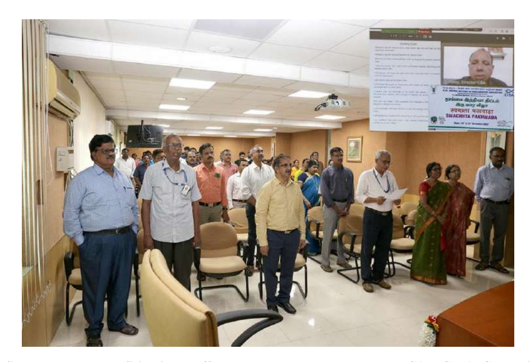
Swachhta Pledge by Scientists, staff, research scholars and students, ICAR-CIBA, Chennai

Swachhta Pledge was taken by the Scientists, Officers, Staff and Students at CIBA Headquarters, Muttukadu Experimental Station (MES) of CIBA, Muttukadu, Navsari Gujarat Research Centre (NGRC) of CIBA, Navsari, Gujarat and Kakdwip Research Centre (KRC) of CIBA, Kakdwip. After the pledge, tree planting was done at MES of CIBA, NGRC of CIBA and KRC of CIBA.