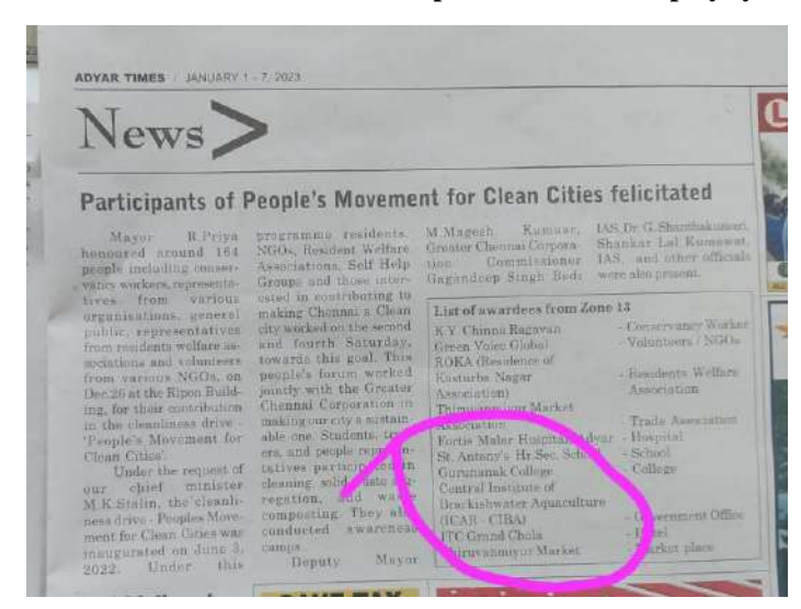
Adyar times newspaper coverage: ICAR-CIBA award for People's Movement for Clean Cities -2022