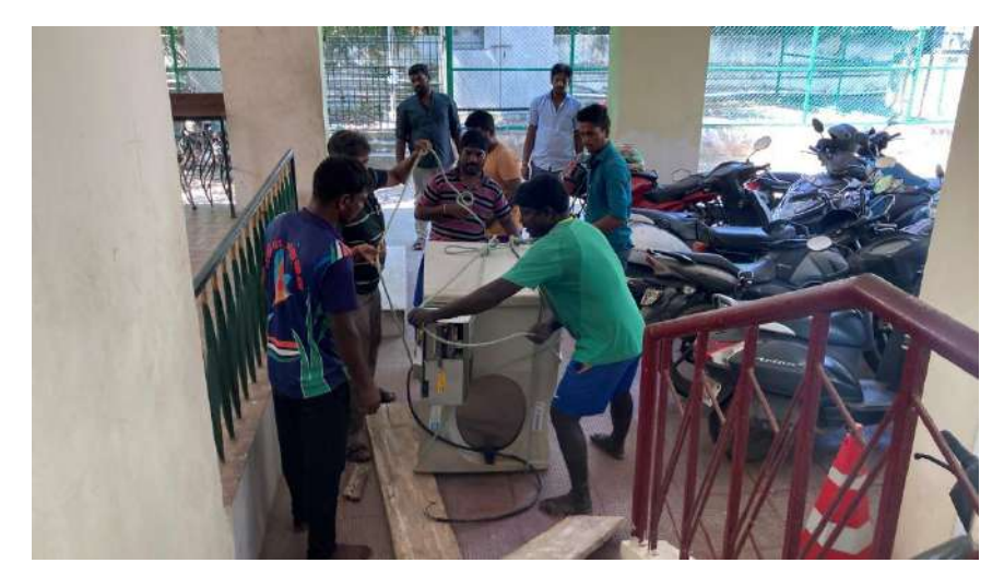
Cleaning of unserviceable items from office premises at Headquarters of CIBA, Chennai

The weeding out of the files and records from Stores, Administration, Audit and Accounts Section and Library and cleanliness drive in various laboratories and common places in the Institute premises including research centres at Gujarat and Kakdwip were undertaken. Due to disposal of materials nearly 600 sq ft space was freed and utilised as a storage facilities, and Rs.8,35,838/- revenue was generated. The processing of files by the Administration, Audit & Accounts and Stores sections were carried out through e-office, being 100% implementation of e-office, this enabling paperless office.