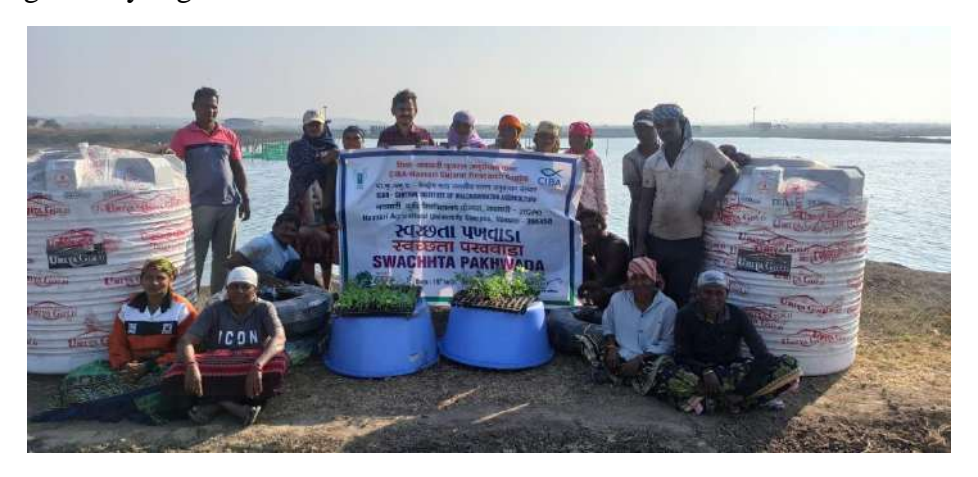
Distribution of vegetable garden materials to tribal farmers, Mendhar vilalge, Navsari, Gujarat

NGRC of CIBA also organized awareness programme on importance of kitchen garden and utilization of pond dyke of Integrated Fish Farming (IFF) model for vegetable garden at Singod, Navsari and Mendhar village, Navsari, Gujarat. CIBA scientists addressed the farmers about the importance of utilization of homestead and fish pond fallow land by converting to kitchen garden for cultivation of horticultural crops and also utilization of pond dyke of IFF model in the form of vegetable garden that provides extra incomes, meet up domestic needs for vegetables and nutrition, and create clean and esthetic surroundings of house and IFF model. This would also help in keeping house premise weed free and maintaining healthy organic environment.