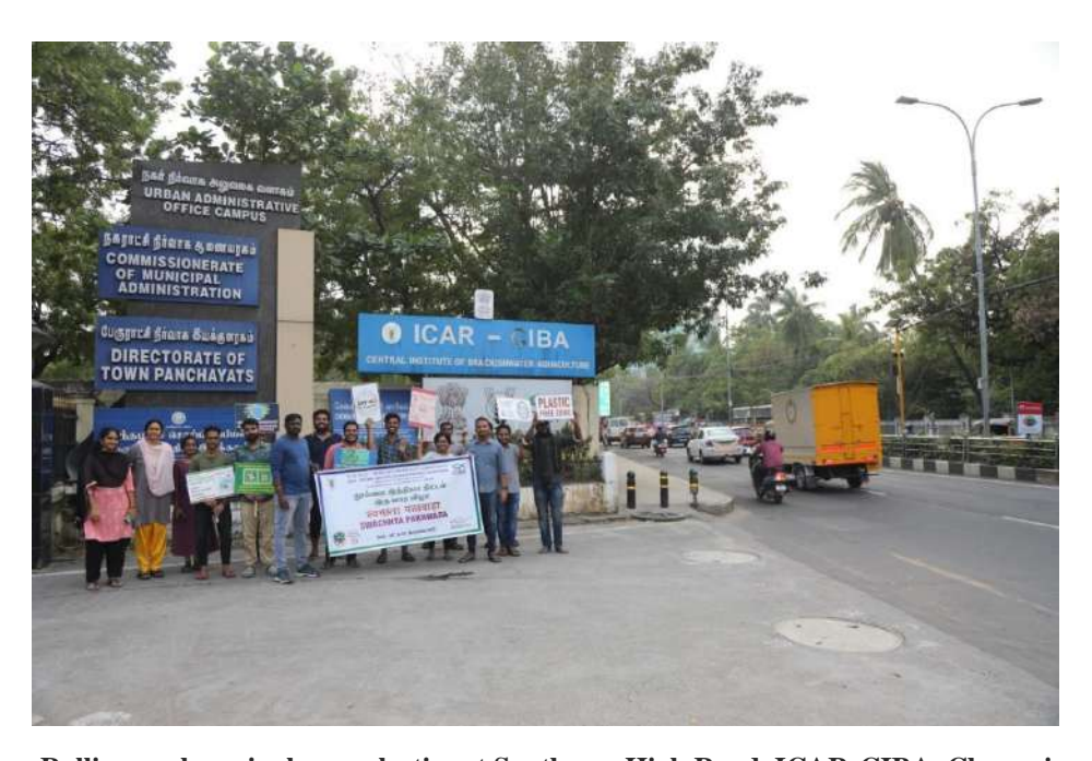
Rallies on shun single use plastics at Santhome High Road, ICAR-CIBA, Chennai