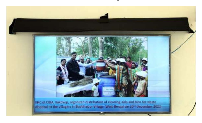
Swachhta Pakhwada activities are posted in CIBA display system