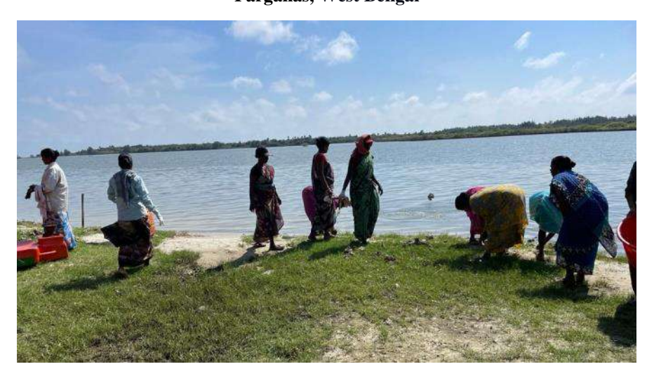
Cleaning of backwater at Kottaikadu village, Kanchipuram, Tamil Nadu