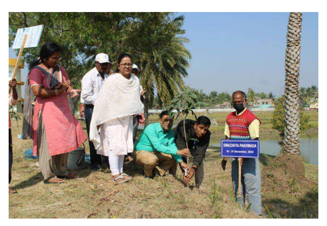
Tree planation at KRC of CIBA, Kakdwip, West Bengal Cleaning of office premises and weeding out of the files and records

The weeding out of the files and records from Stores, Administration, Audit and Accounts Section and Library and cleanliness drive in various laboratories and common places in the Institute premises including research centres at Gujarat and Kakdwip were undertaken. Due to disposal of materials nearly 600 sq ft space was freed and utilised as a storage facilities, and Rs.8,35,838/- revenue was generated. The processing of files by the Administration, Audit & Accounts and Stores sections were carried out through e-office, being 100% implementation of e-office, this enabling paperless office.