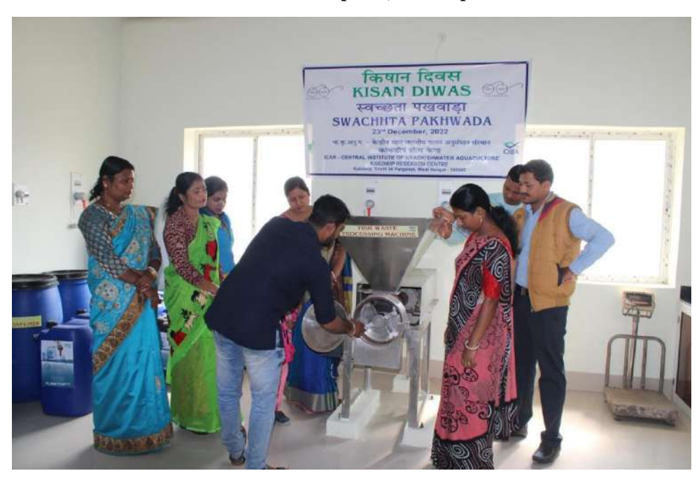
Demonstration of preparation of fish waste to values added product, KRC of CIBA, Kakdwip