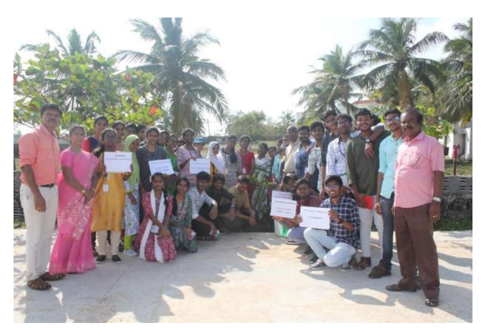
Awareness program and rallies among Fisheries College students and staff of CIBA at MES of CIBA, Muttukadu, Tamil Nadu

Awareness cum rallies and tree planation programme were organised with students and scholars from Fisheries College, Thoothudui and CIBA at MES of CIBA, Muttukadu, Santhome High Road, Santhome and M.R.C main road, Raja Annamalai Puram, Tamil Nadu. Various Placards explaining about different means to avoid plastic waste, go greens, say to no plastics etc was administered to the participants.